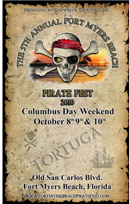
Sample Program Cover From Previous Year