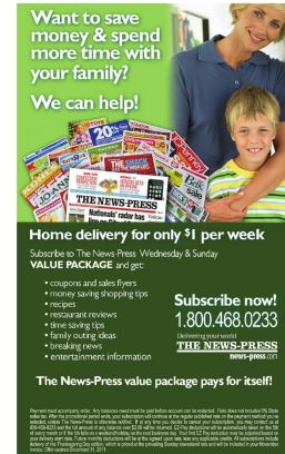
Sample Back Cover From Previous Year

Program Ads must be submitted as a .jpg 300dpi or higher. Image must be sent to specified dimensions. If you need help with graphic design, your ad can be prepared for a nominal fee.